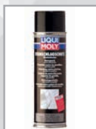
Stoneguard can be painted over, spray, gray, Part no. 6105/500 ml