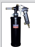
Compressed Air Can Gun, Part no. 6220