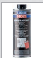
Stoneguard can be painted over, spray, gray, Part no. 6106/1 l