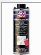
Stoneguard can be painted over, spray, black, Part no. 6110/1 l