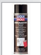
Stoneguard can be painted over, spray, black, Part no. 6109/500 ml