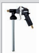
Spray Gun, Part no. 6219